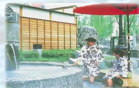
Dogo Onsen (Hot Spring)