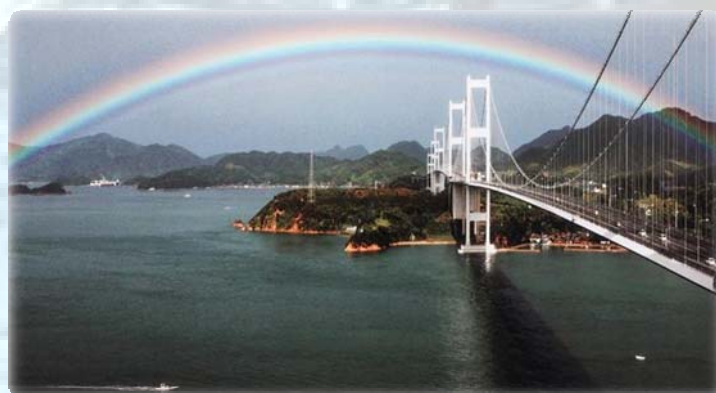
The big bridge (Shimanami Kaido) on Seto Island Sea